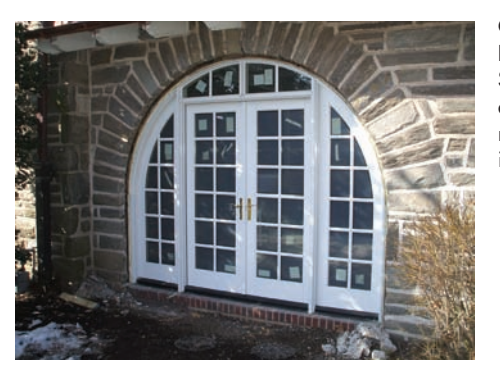
Chapman Windows and Doors installed this SEMCO window and door combination unit to replace an old wood unit in the stone opening.