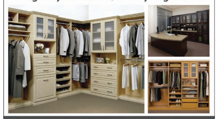
Custom Closets, Garage Cabinets, Home Offices and more..