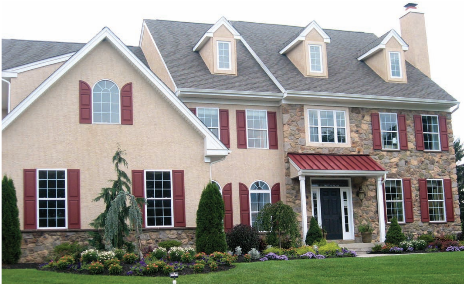
Exteriors Associates Inc. transforms the exterior of your home. The company installs roofing, siding, seamless gutters and shutters with extreme professionalism, attending to every detail.