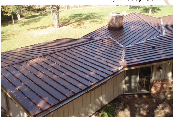
A metal roof, such as this one from Global Home Improvement, Inc., is not only durable but can help keep energy costs down.

Though it's the first thing that people see when they look at a home, and not maintaining it can significantly bring down the value, many homeowners wind up ignoring the exterior of their home until it's too late.