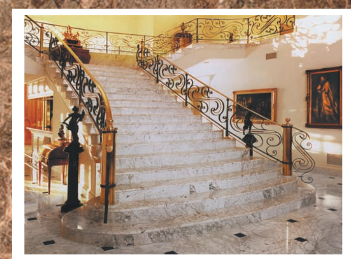
The quality of our work is reflected by the satisfaction of our clientele.