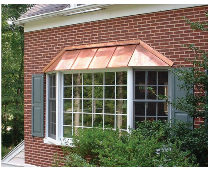
Chapman Windows and Doors installed this SEMCO bay window in place of a flat combination double-hung unit. The copper roof was also built on-site.

Don't forget to maintain the appearance of your front door, keeping it in tip-top shape as a welcoming entryway. There should be no peeling paint or dulled and scratched doorknobs. A multitude of styles, product materials and colors, as well as glass panel coordinates, are available to match or complement your home's design and suit your preference.