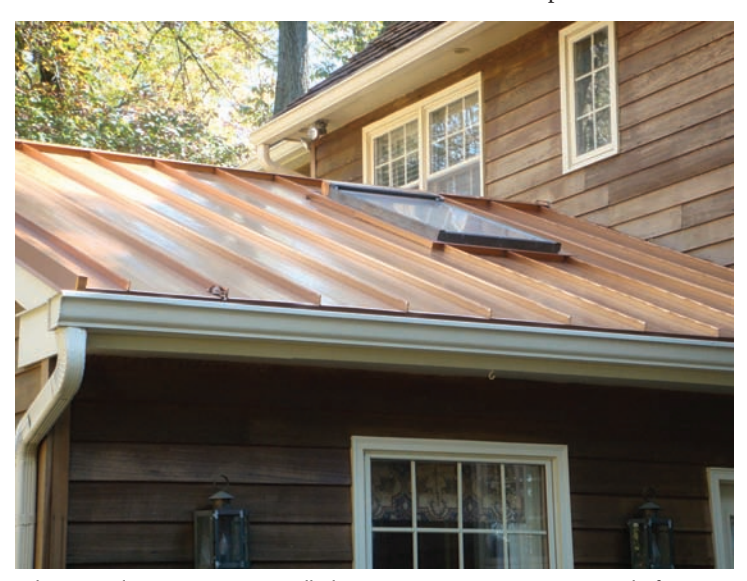
When seamless gutters are installed as one continuous piece, instead of in sections, they won't leak. These gutters are from Global Home Improvement, Inc.

Stucco, a cement mixture, is another option for siding. It can be applied directly to brick and concrete, or can be applied to a wood frame by being placed over top a lath which is a paper or wire mesh. Traditional stucco is a durable material that holds up well in wet