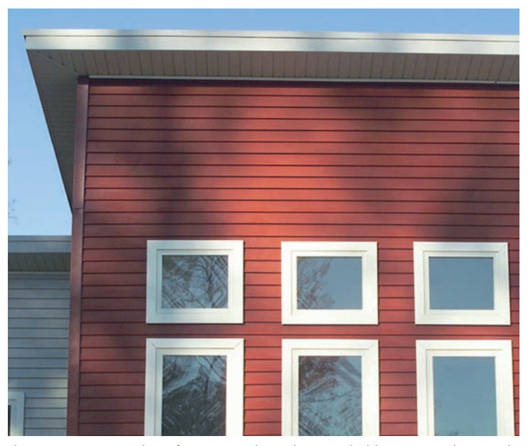
This Preservation High Performance siding, shown in bold autumn red, is available through Somerville Aluminum.

believes the popularity of metal roofing products has increased dramatically over the past decade as a result of the many benefits this product has to offer.